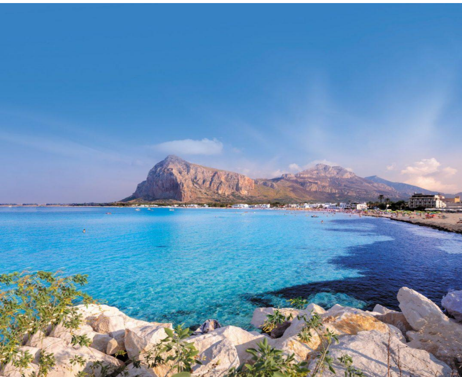
San Vito lo Capo