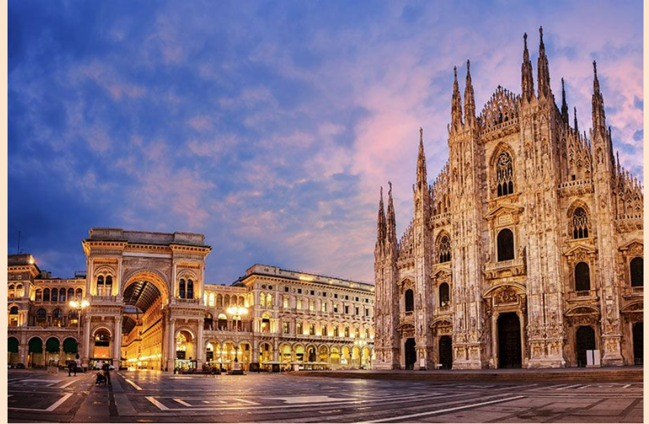
Piazza del Duomo