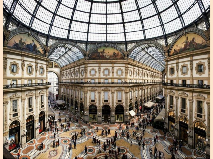
Galleria Vittorio Emanuele II