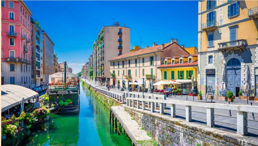
I Navigli di Milano