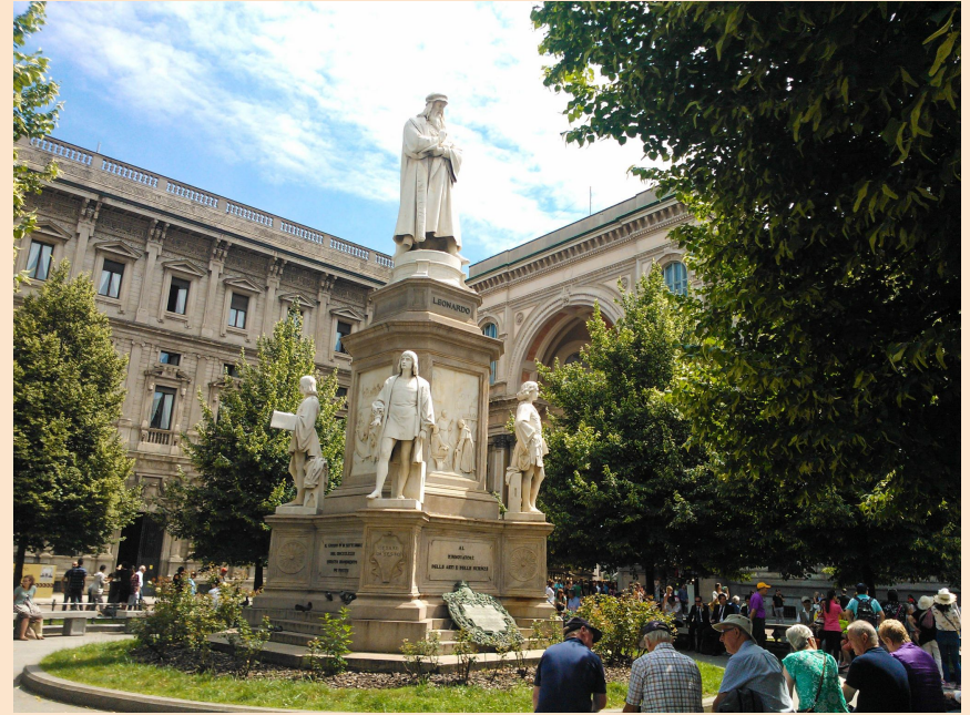
Piazza della Scala